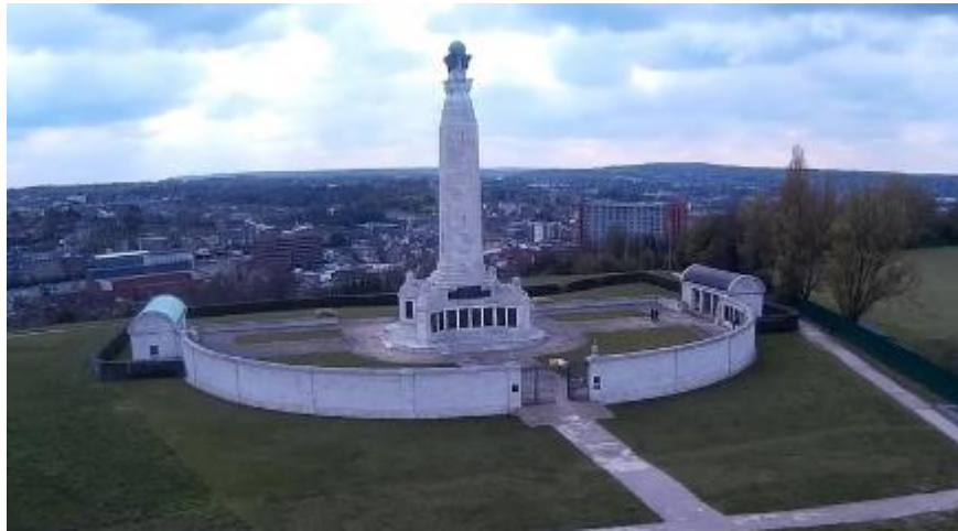
Chatham Naval Memorial